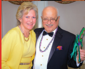
The 2016 theme of the Foundation's ever-popular special event was "Mardi Gras Madness." Foundation supporters gathered at Traditions at the Glen for the annual party and silent auction.