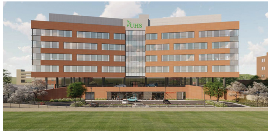
In 2020 UHS forged ahead with the Wilson Project on the campus of UHS Wilson Medical Center.

The Wilson Project is an integral part of UHS’ overall strategic plan and facilities master plan. Our organization needs to be able to meet patients’ needs now and in the future, including the critical need for private hospital