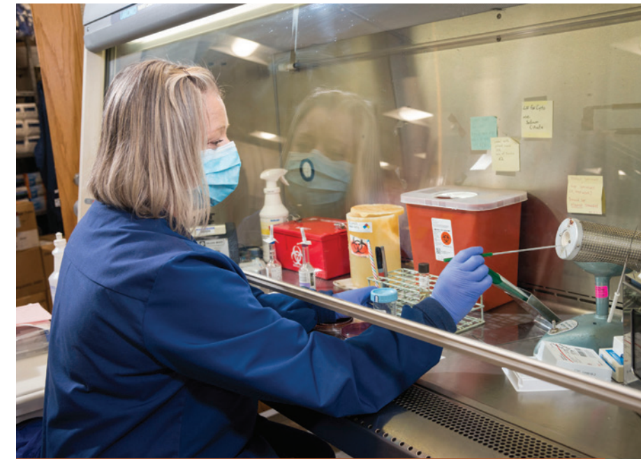
In spite of the challenges of 2020, UHS continued to enhance clinical care and service.

The Emergency Department at UHS Delaware Valley Hospital was named a 2020 Pinnacle of Excellence Award winner by Press Ganey. The award recognizes top-performing clients from healthcare organizations nationwide on the basis of extraordinary achievement and consistently high levels of