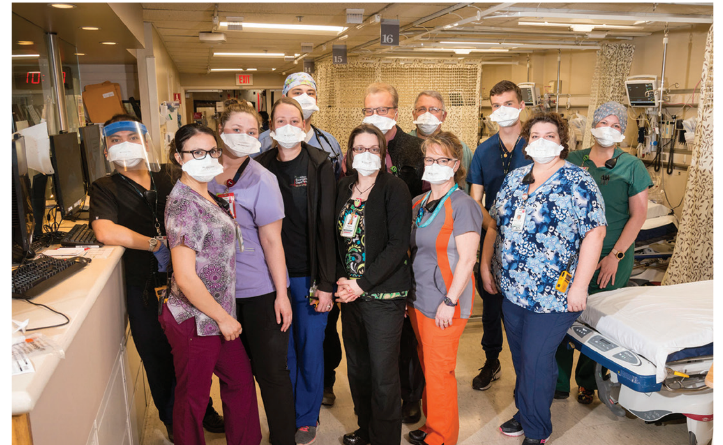
For the people of UHS, and the people we served, 2020 was a time of challenge—also one of gratitude and hope.

The switch from many fragmented systems to Epic represented our opportunity to provide ever-better care to our patients, to be a better institution for clinical outcomes and to manage our populations better in terms of overall health. Epic's implementation was successful, and it has already proved its value through better care, higher quality and greater collaboration, plus strong patient engagement via MyChart.