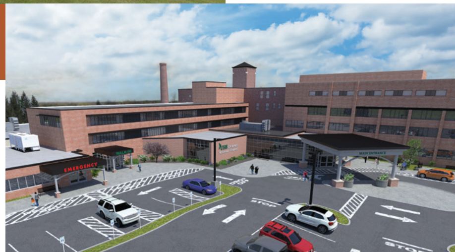
The Chenango Medical Neighborhood is an investment in quality care for the future at UHS Chenango Memorial Hospital.