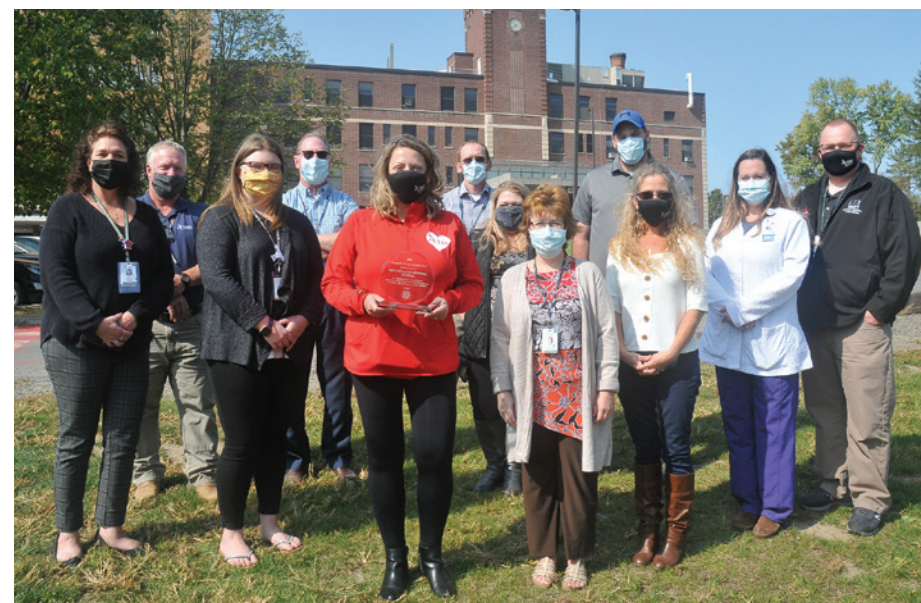
UHS Chenango Memorial was named Chenango County's "Nonprofit of the Year."

UHS Chenango Memorial launched the largest and most ambitious concentrated investment in its facility and campus in 50 years with the start of the Chenango Medical Neighborhood project. During the year, UHS Chenango Memorial opened a new Women's Health Center and broke ground for a new Emergency Department and Walk-In Center. Community giving to the capital campaign for the project surpassed $6 million during the year.