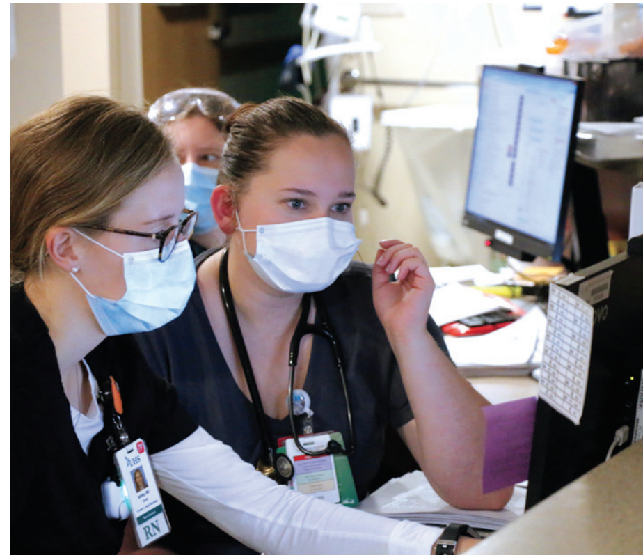
Employees in many disciplines became proficient in Epic, which went live across the System in September 2020.

Go-live on Sept. 12 was just the beginning. That moment was the culmination of many years of considering how to simplify and advance our healthcare recordkeeping, and reflected our long-term technology strategic planning.