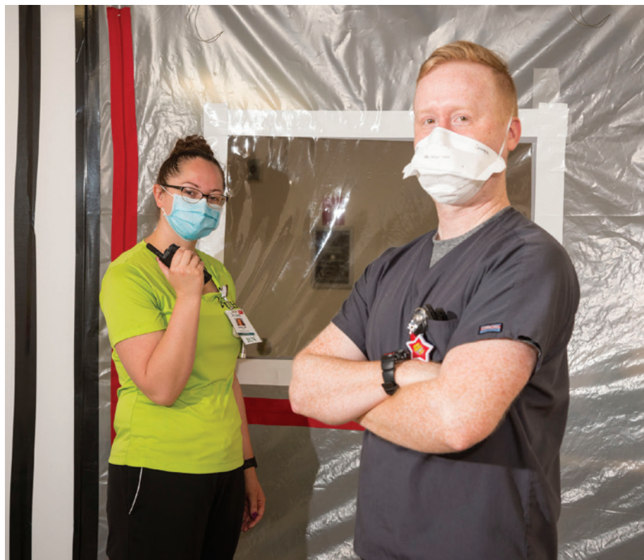
UHS created well over 200 negative-pressure rooms System-wide.

Security and other departments. COVID rooms at UHS' hospitals were set up with anterooms where our physicians, nurses, technicians, therapists and other clinical staff could put on and take off PPE before entering and after leaving each patient's room, ensuring a sanitized environment for care. Remote monitors were also purchased and put into use. During the year, virtual health options became more important and saw greater use by patients and providers, signaling a trend for the wider use of telemedicine as a key