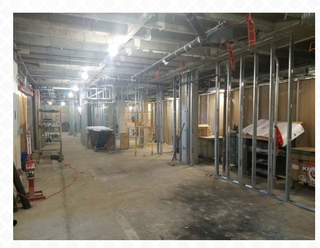
Above (top photo): Excavation for new conference room. Above (bottom photo): Interior framework for the new Emergency Room.